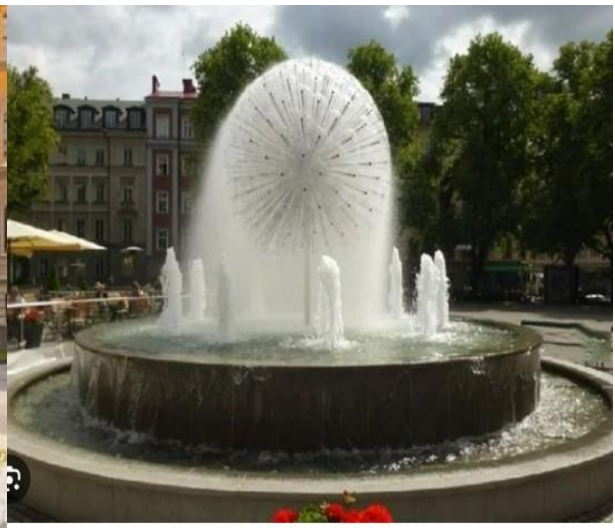
Sample Picture of Dandelion Fountain (Item no. 83)