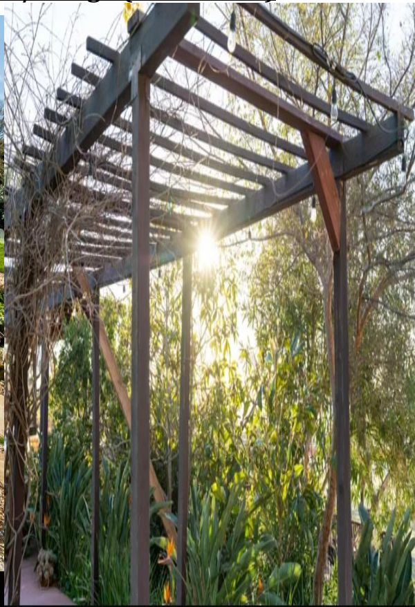
Sample Picture of Pergola Design (item MS Fabrication)