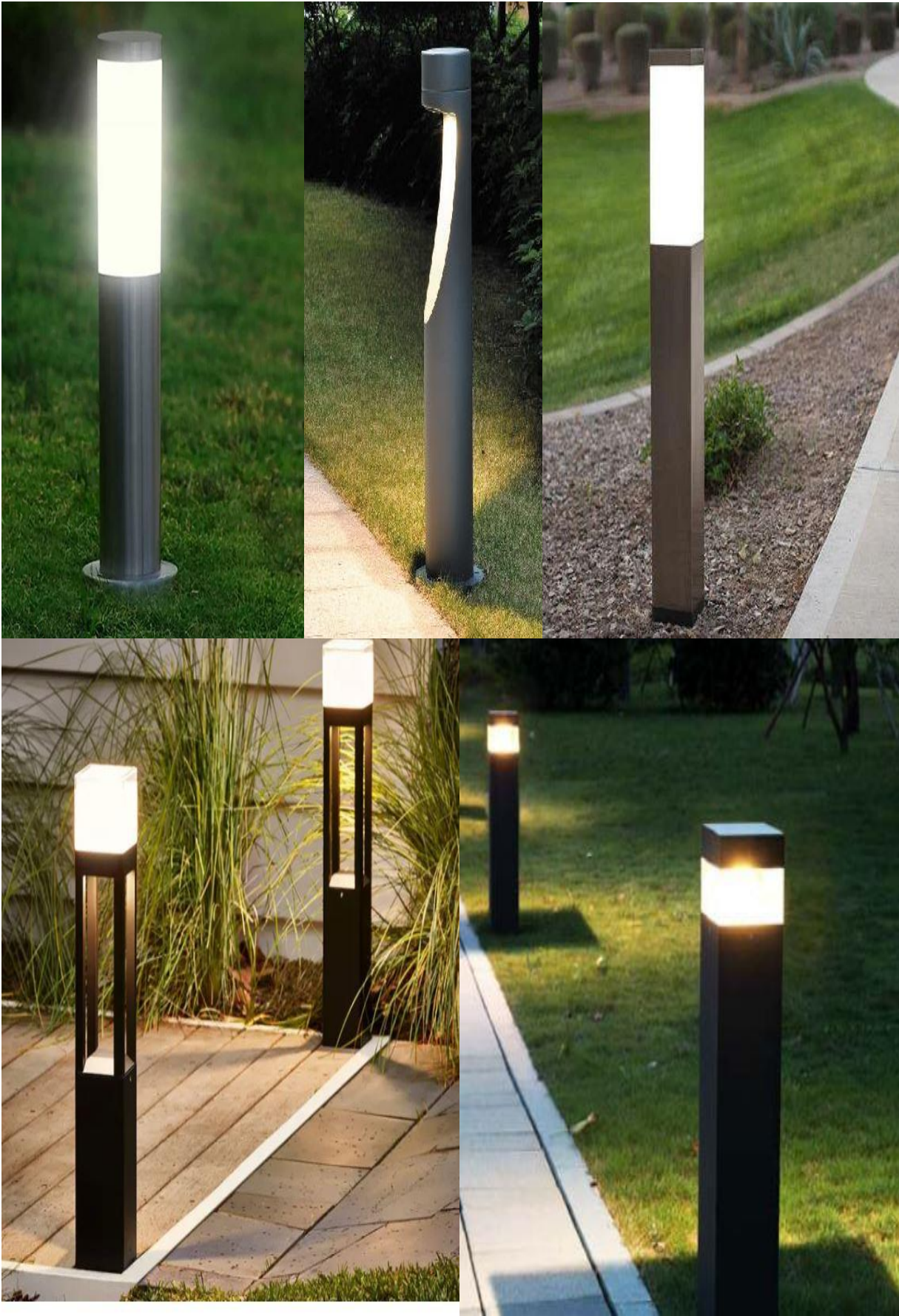
SAMPLE PICTURE OF 1 METER BOLLARD LIGHTS (ITEM NO 70)