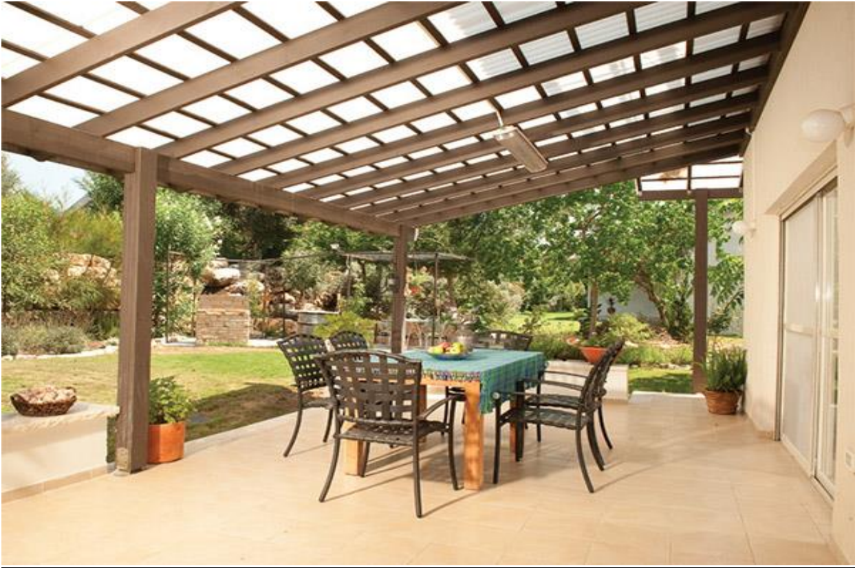
Sample Picture of Multicell Polycarbonate sheeting Design (item no. 24)