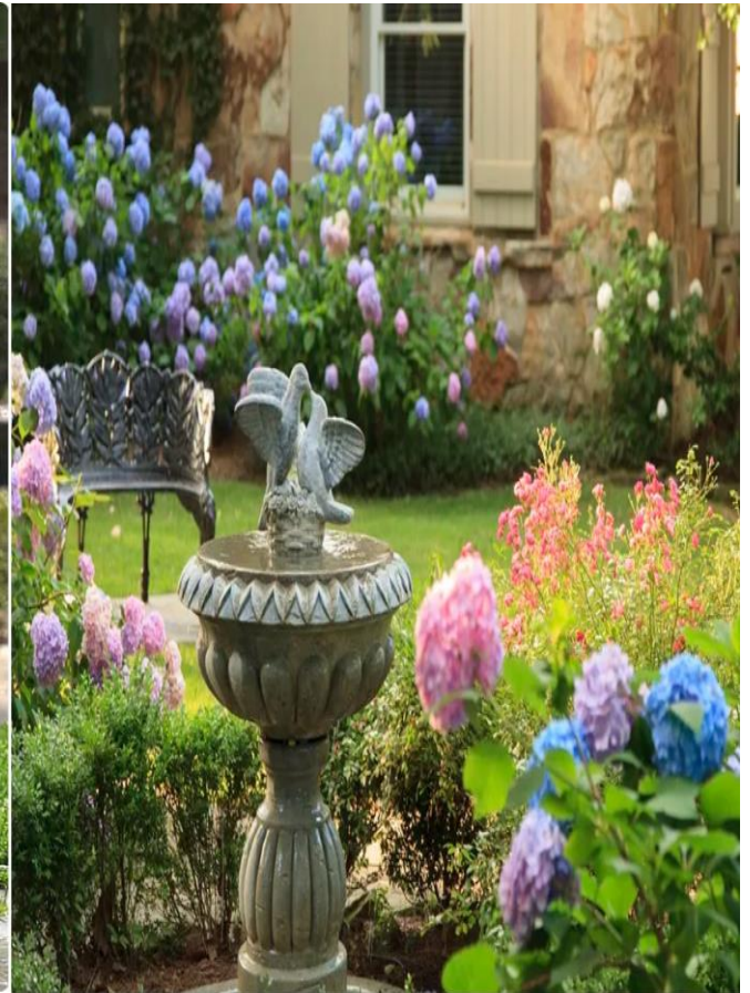
Sample Picture of Bird Bath Sculpture/Design (item no. 84)