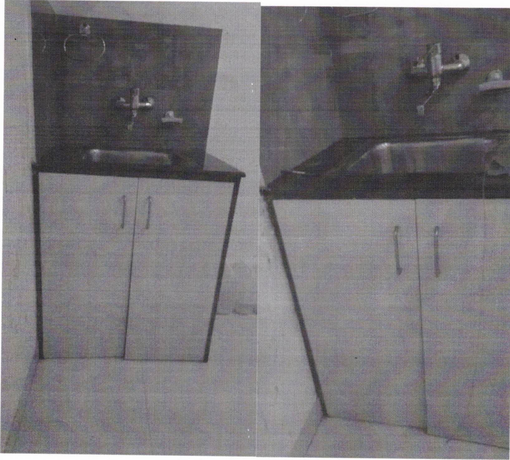
Photograph of existing S S scale