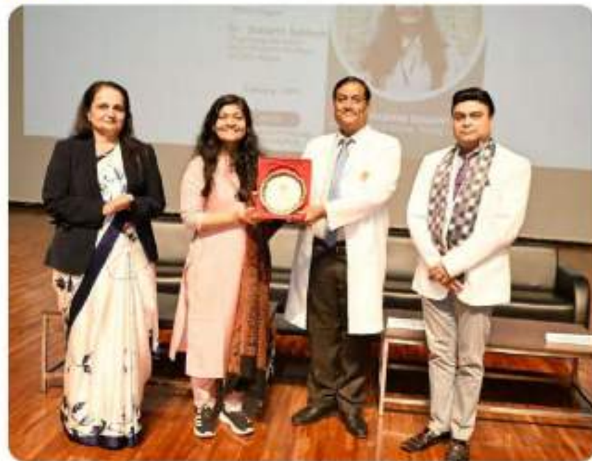
New Year Celebration